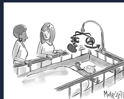
"ALEXA PICKED IT OUT."